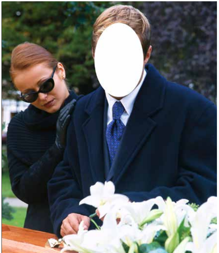
Figure 2. You don't need to see the face to understand how this man feels.

Although these materials can help children with autism learn about different emotions in a rote manner, they do not reflect emotion recognition as it happens in real life.